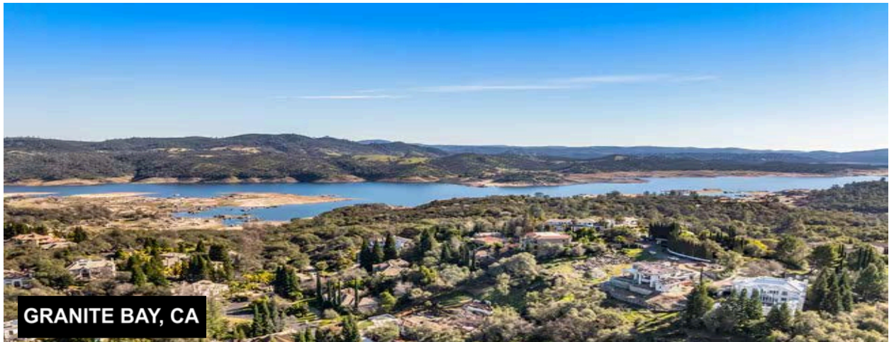
GRANITE BAY, CA