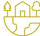
Real Estate and Rental Leasing