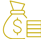
Finance and Insurance