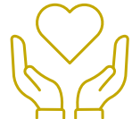
Health Care and Social Assistance